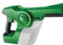
VP200ES Electrostatic Mister