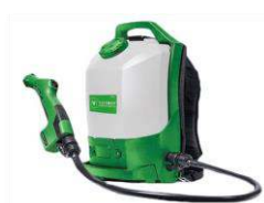
VP300ES Electrostatic Mister