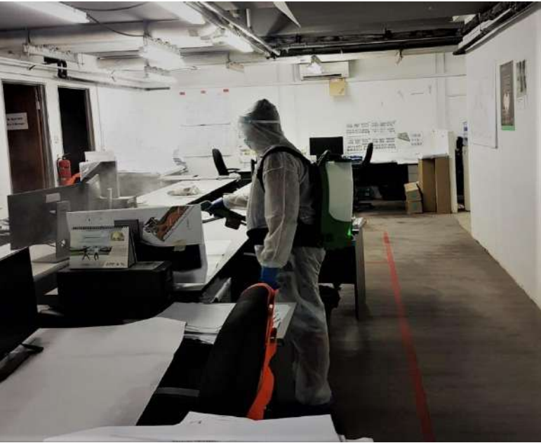
Disinfection process at C885 using VP300ES Electrostatic Mister